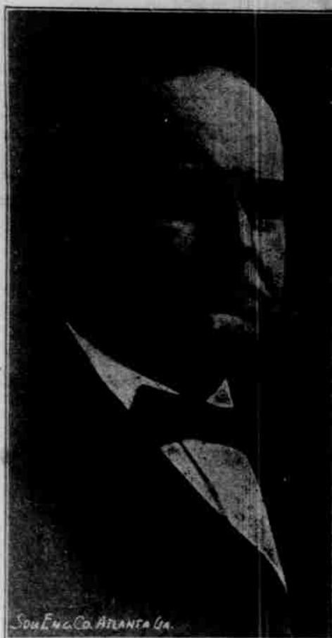
HON. WILLIAM JENNINGS BRYAN

Mr. Bryan arrived from his win- ter home in Miami late this afternoon to fill his engagement to deliver a chautauqua lecture at the New Day- tona theater tonight and will remain